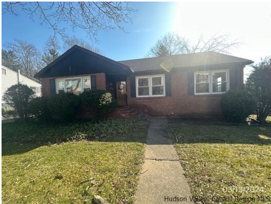
Hudson Valley - Catskill Region MLS