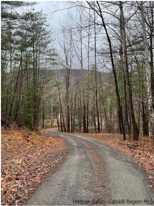
Hudson Valley - Catskill Region MLS