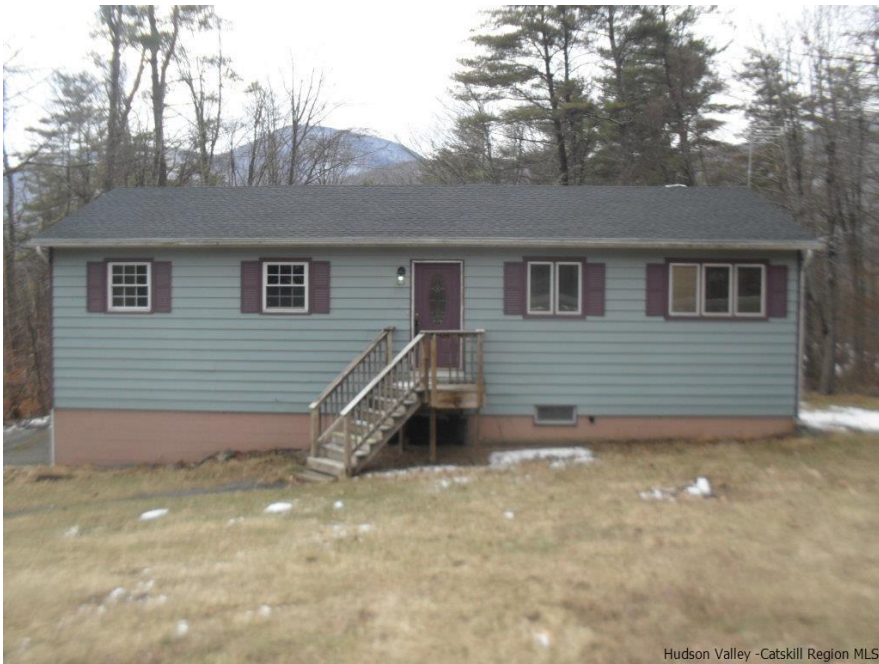
Hudson Valley - Catskill Region MLS