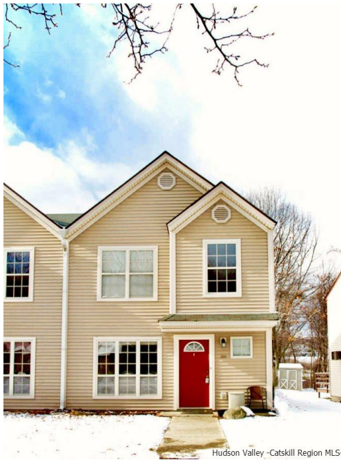
Hudson Valley - Catskill Region MLS