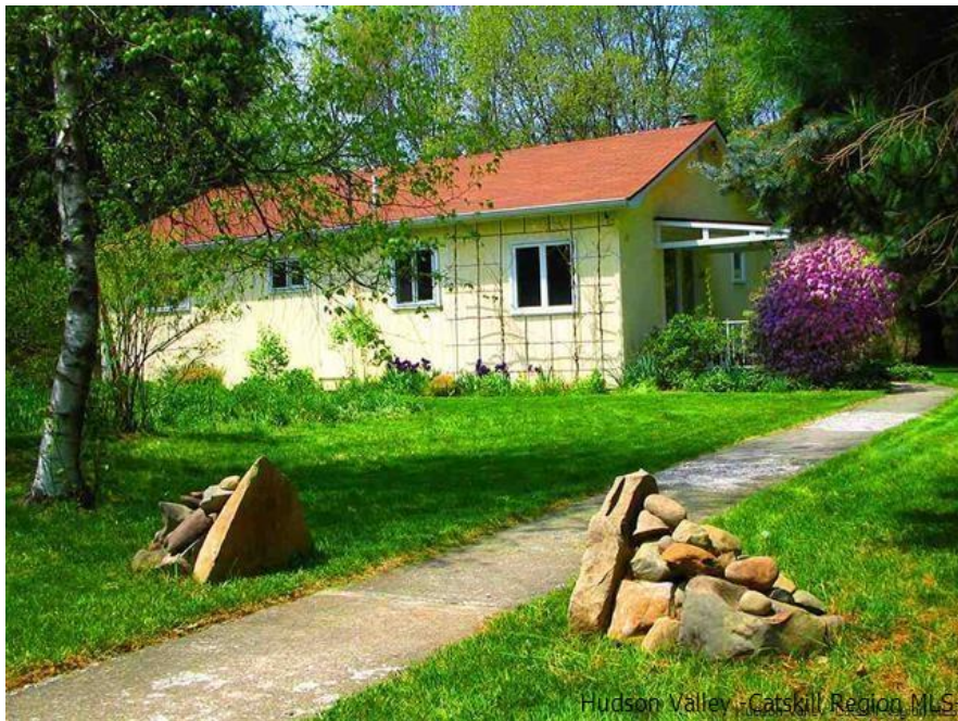
Hudson Valley - Catskill Region, MLS