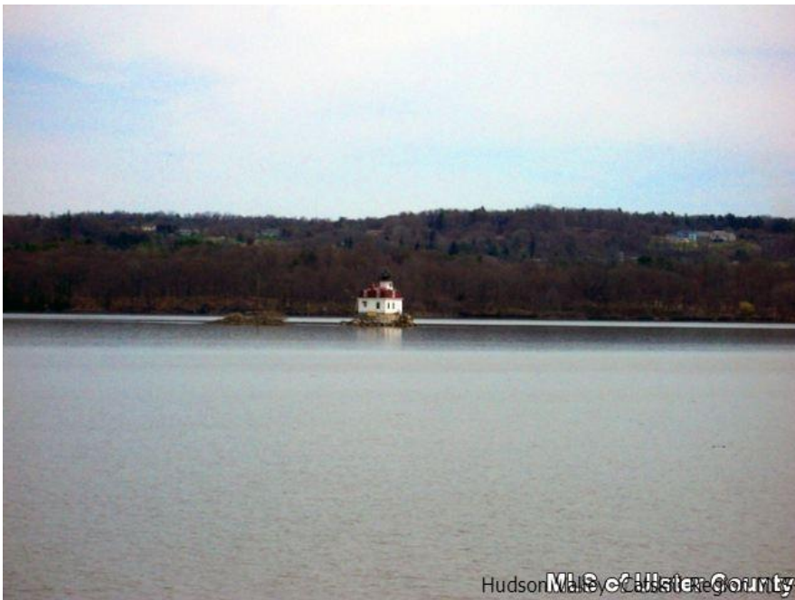
Hudson Valley Capital Region, NY