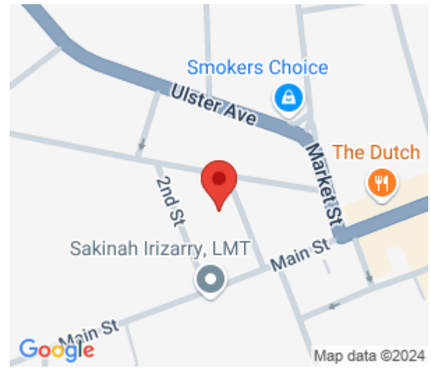
SHANDAKEN NY-28, Phoenicia, NY