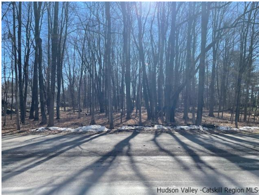
Hudson Valley -Catskill Region MLS-