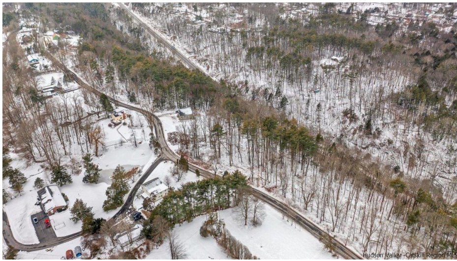
Hudson Valley - Catskill Region MLS