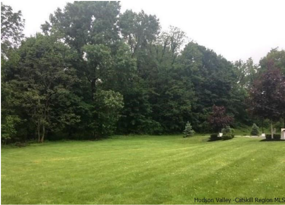
Hudson Valley -Catskill Region MLS