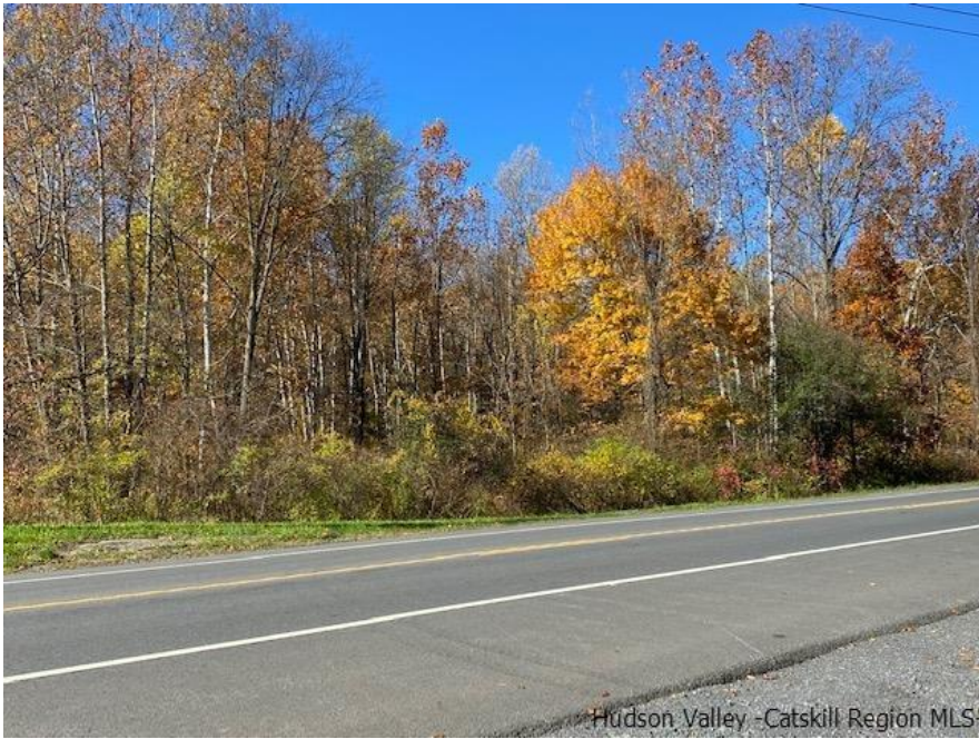
Hudson Valley - Catskill Region MLS