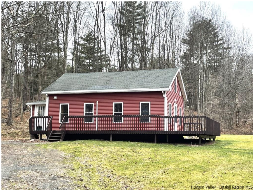
Hudson Valley - Catskill Region MLS