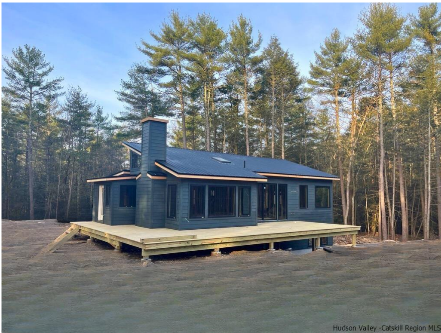
Hudson Valley - Catskill Region MLS