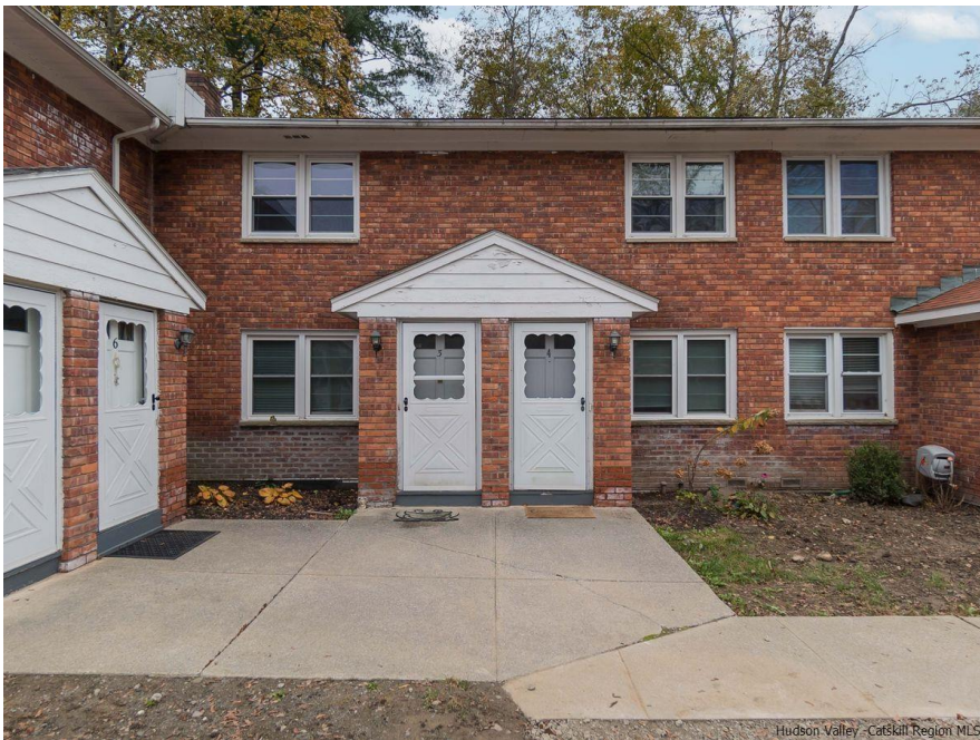
Hudson Valley - Catskill Region MLS