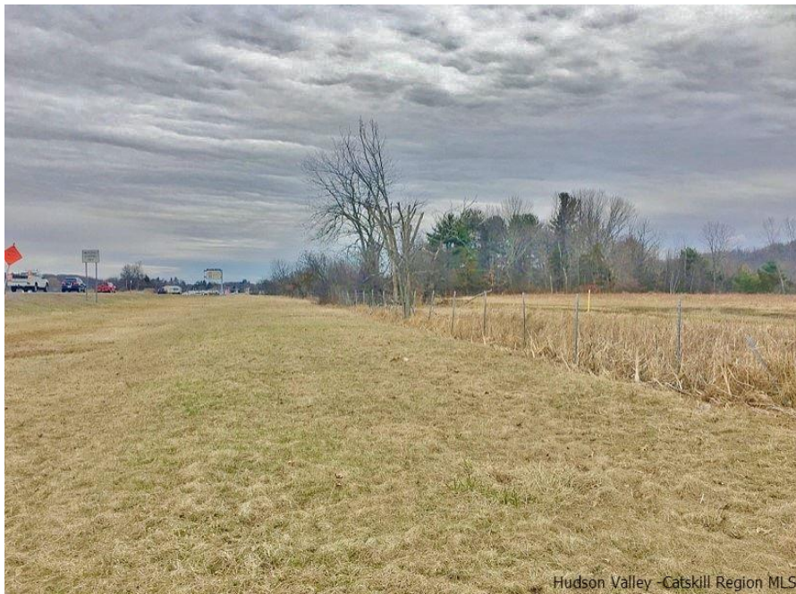
Hudson Valley - Catskill Region MLS