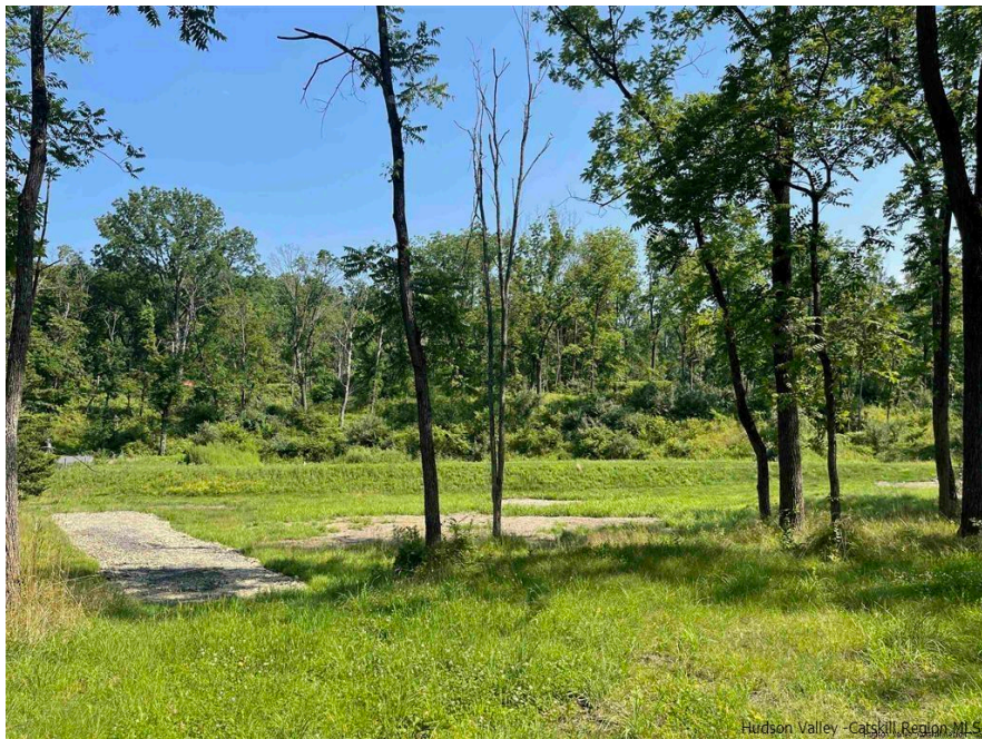
Hudson Valley - Catskill Region, NY