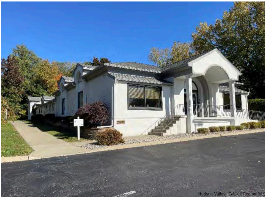
Hudson Valley - Catskill Region MLS