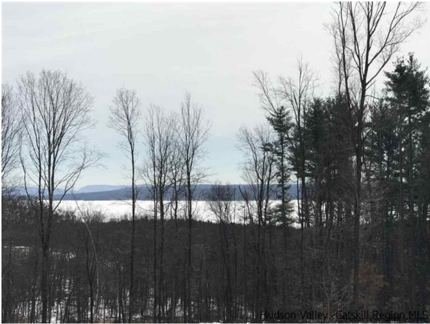
Hudson Valley - Catskill Region, ML S