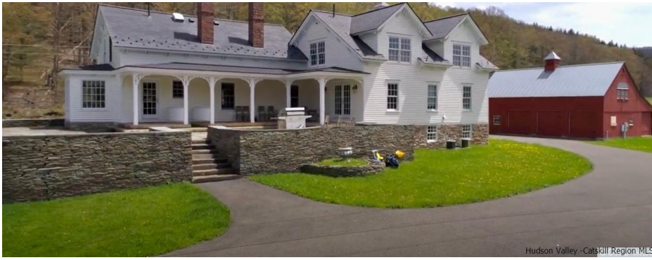
Hudson Valley - Catskill Region MLS