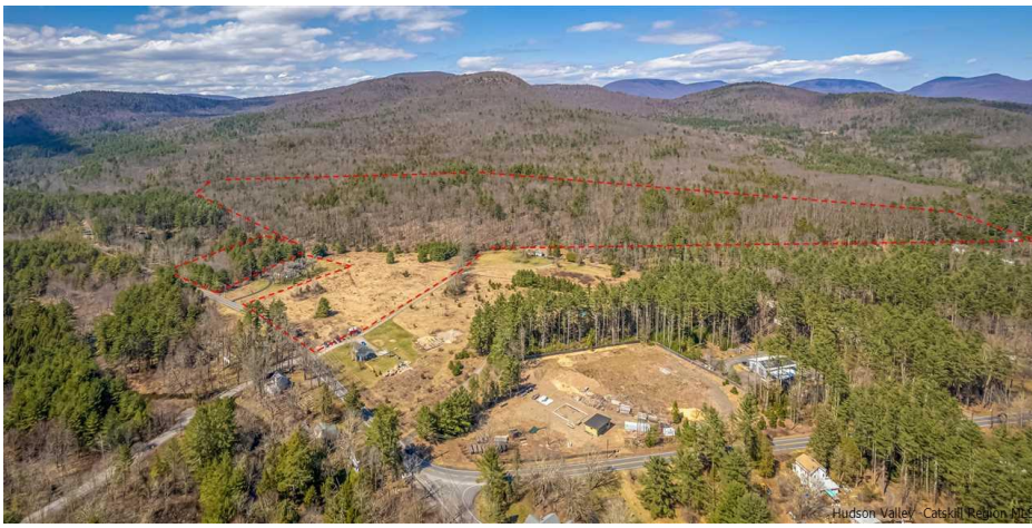
Hudson Valley - Catskill Region, NY