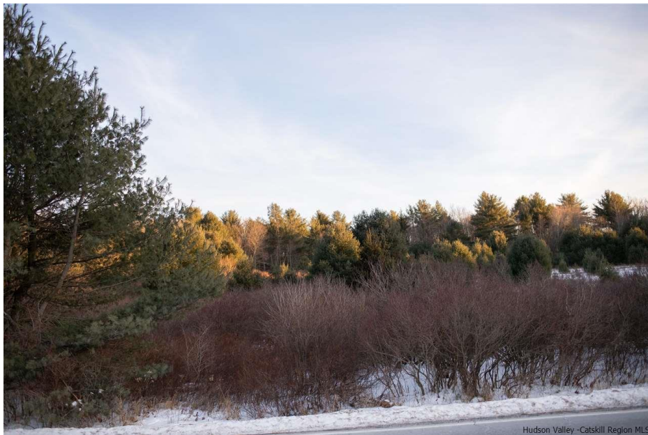
Hudson Valley - Catskill Region MLS