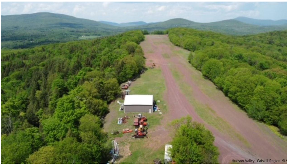
Hudson Valley - Catskill Region MLS