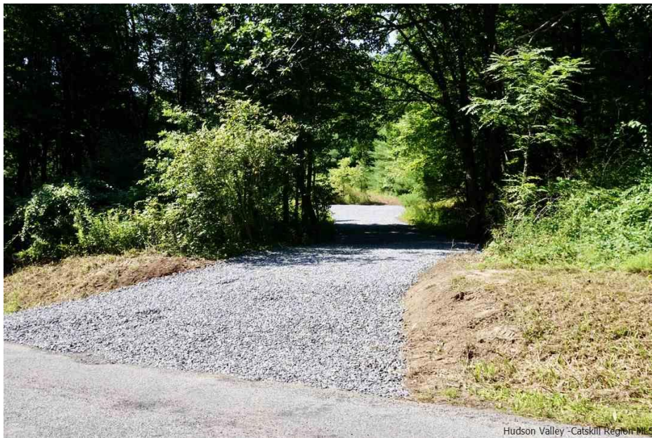
Hudson Valley - Catskill Region MLS